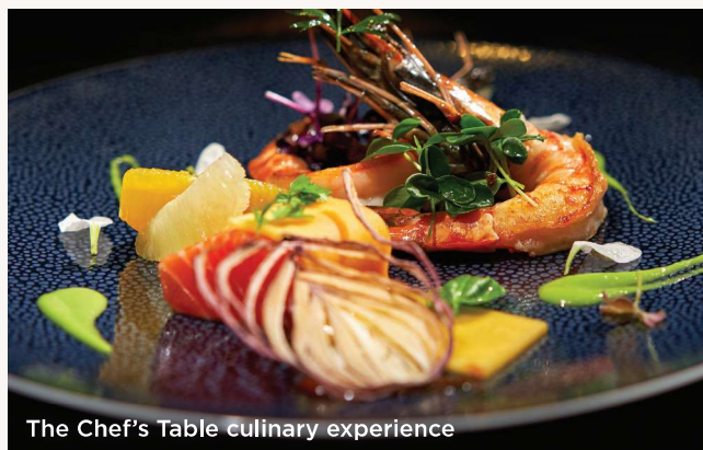
The Chef's Table culinary experience