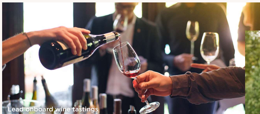
Lead onboard wine tastings