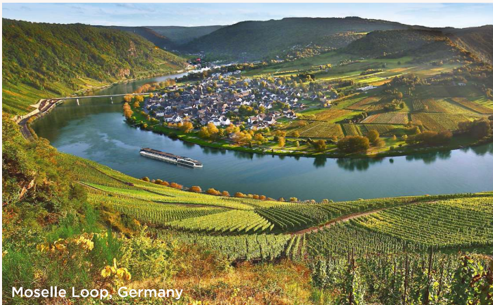
Moselle Loop, Germany