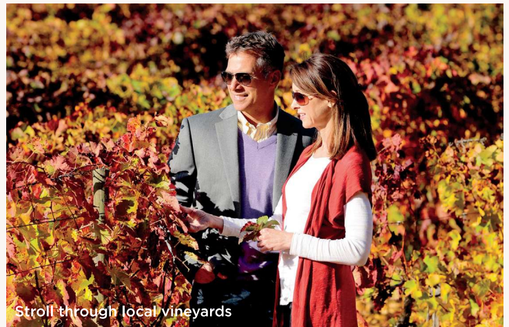
Stroll through local vineyards

Imagine the members of your wine club toasting life's sweetest moments with your most celebrated bottles while cruising through one of Europe's most renowned wine regions. When you join us as a Wine Host on one of our palate-pleasing Celebration of Wine River Cruises, you'll discover iconic vineyards and historic cellars in breathtaking destinations. Discover France's Bordeaux region, Portugal's storied Douro Valley, Austria's Wachau Valley, and beyond, all while inspiring your followers – and other guests – with your finest wines. Plus, pair your wine with gourmet regionally-inspired cuisine on board.